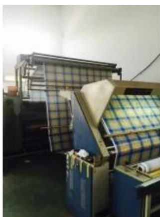
Colchão de impressão fábrica de tecidos Stichbond