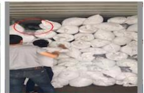
TRY BEST TO LOAD FULL