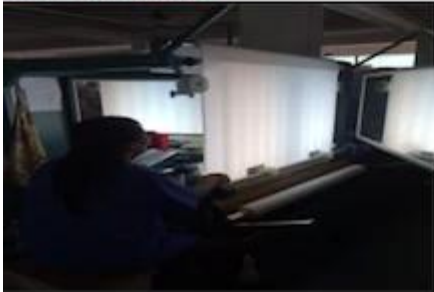
FABRIC FIRST TIME CHECKING