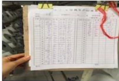
DETAILS NOTE DOWN