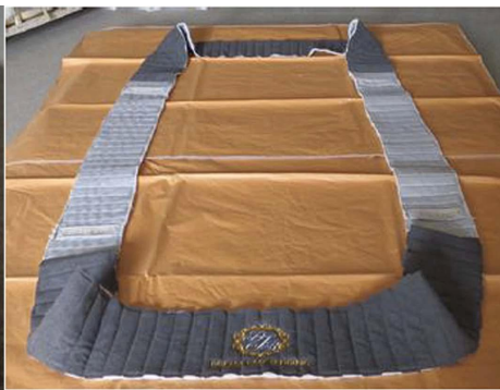
mattress big border