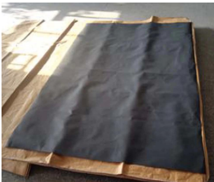
thick nonwoven fabric