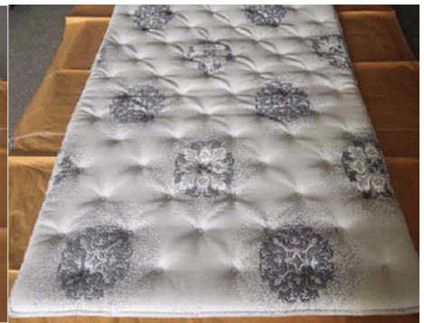
mattress top panel