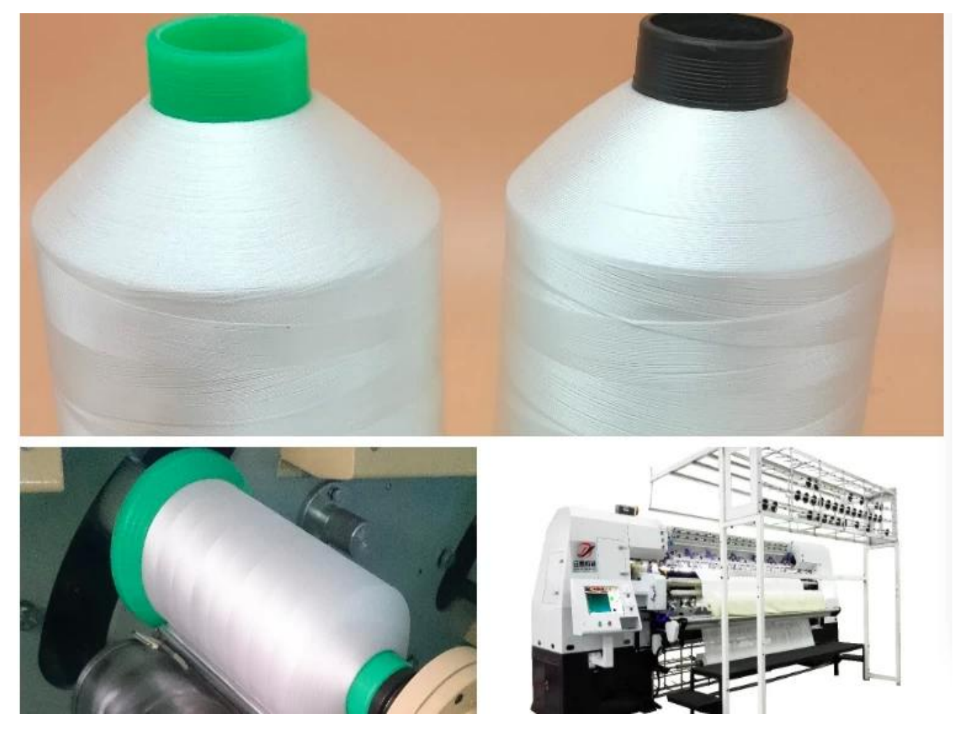
The cocoon bobbin thread can be used for