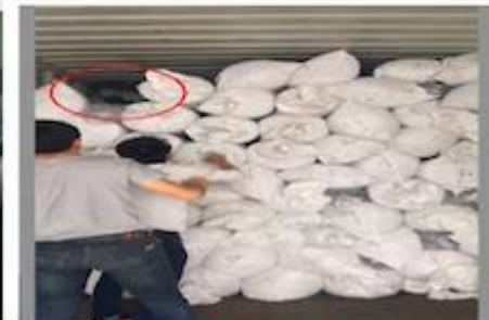
TRY BEST TO LOAD FULL