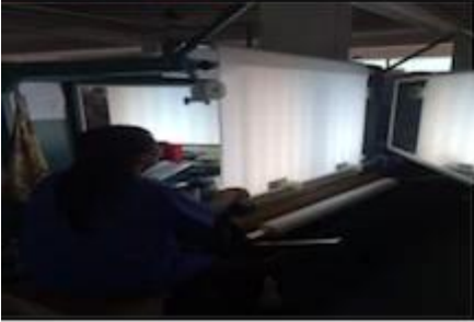
FABRIC FIRST TIME CHECKING