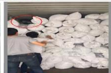
TRY BEST TO LOAD FULL