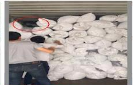
TRY BEST TO LOAD FULL