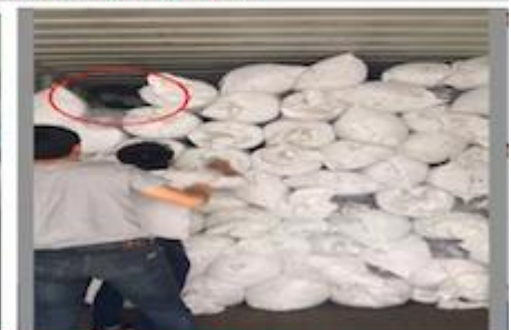
TRY BEST TO LOAD FULL