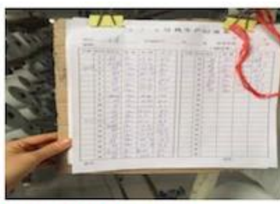
DETAILS NOTE DOWN