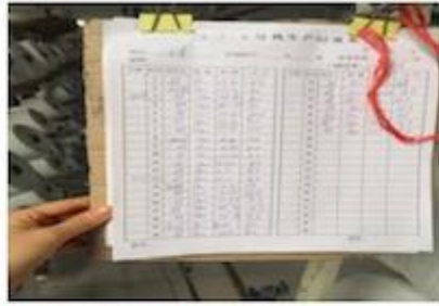
DETAILS NOTE DOWN