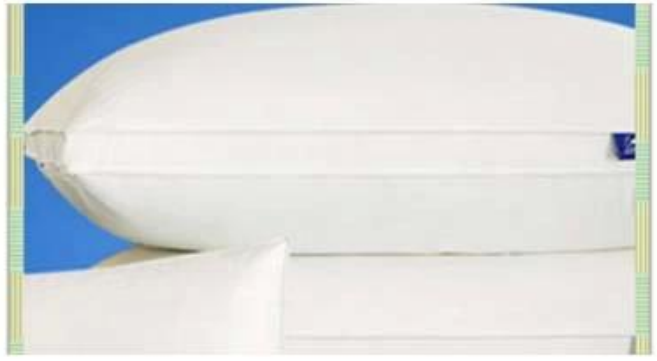
making mattress for pollows