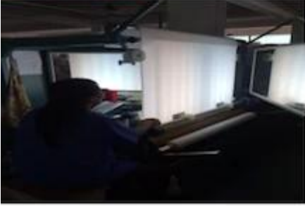
FABRIC FIRST TIME CHECKING