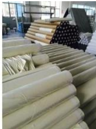
stichbond Cotton Fabric