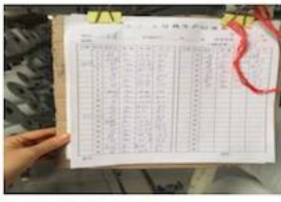
DETAILS NOTE DOWN