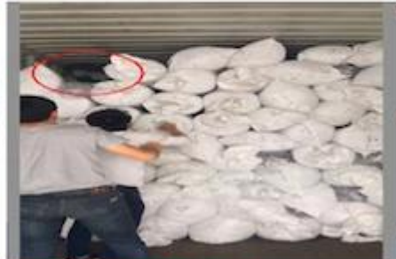
TRY BEST TO LOAD FULL