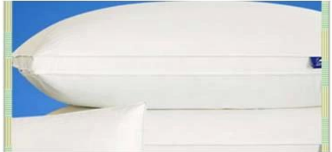
making mattress for pollows