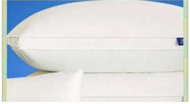
making mattress for pollows