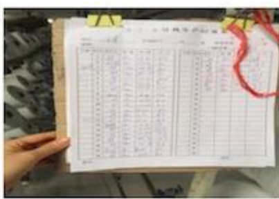
DETAILS NOTE DOWN