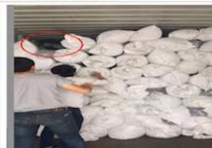
TRY BEST TO LOAD FULL