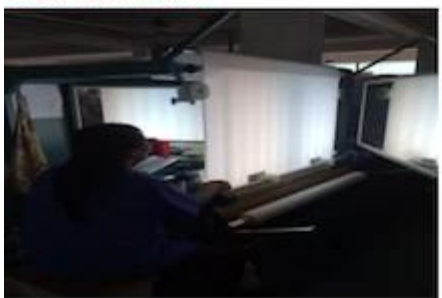
FABRIC FIRST TIME CHECKING