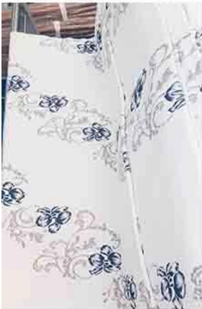
설계 / 수량 점검