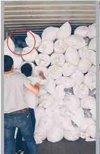
가득차도록 최선을 다하십시오.