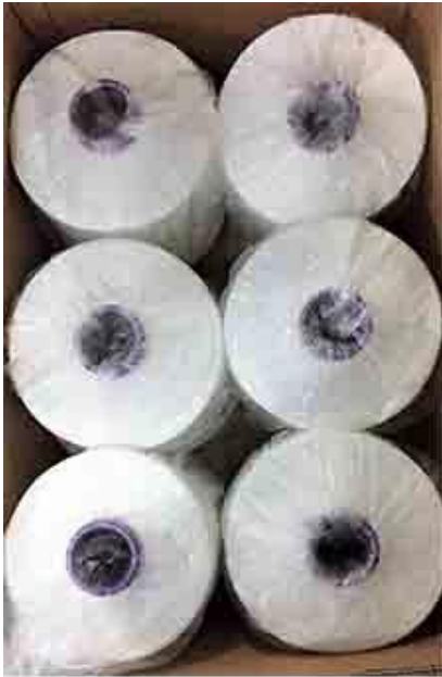
전나무 미터 및 안정된 원사