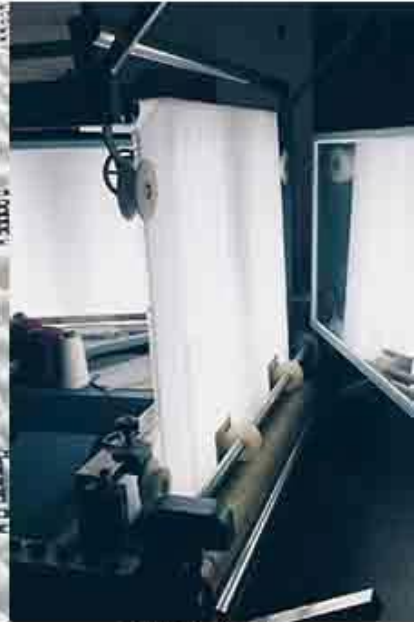
직물 품질 검사