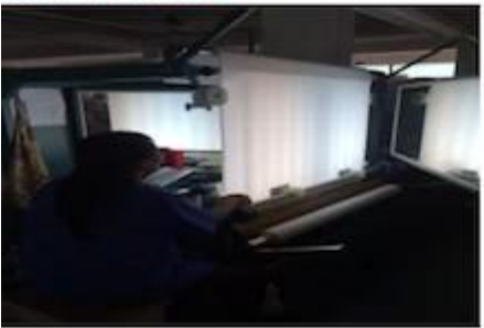
FABRIC FIRST TIME CHECKING