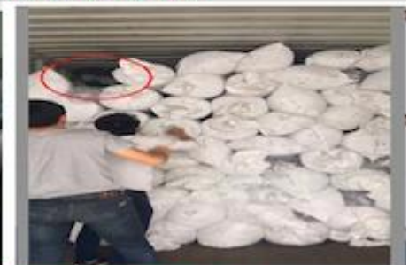
TRY BEST TO LOAD FULL