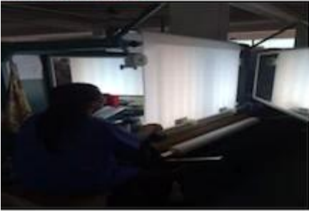
FABRIC FIRST TIME CHECKING