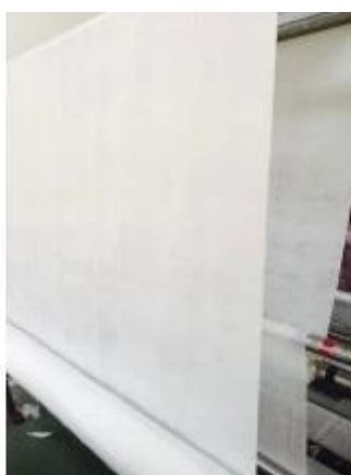
Stampa materasso Stichbond fabbrica di tessuti