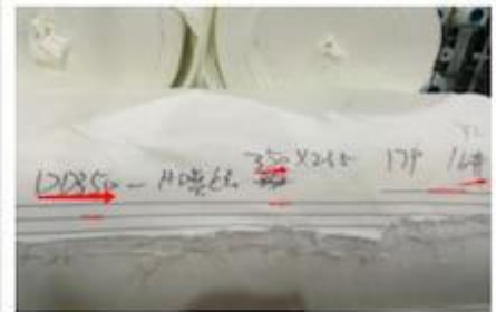
DETAILS ON FABRIC