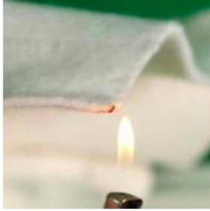
Flame Retardant Cotton