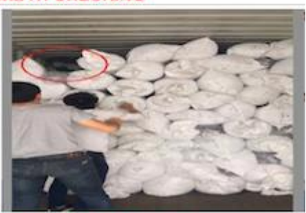
TRY BEST TO LOAD FULL