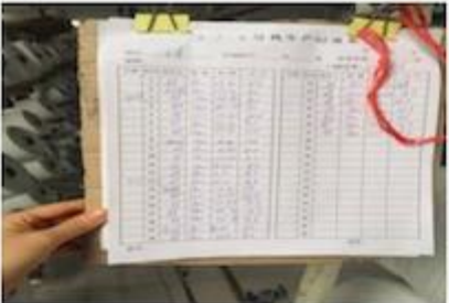
DETAILS NOTE DOWN