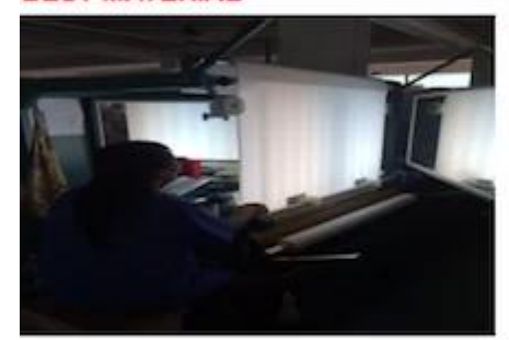
FABRIC FIRST TIME CHECKING