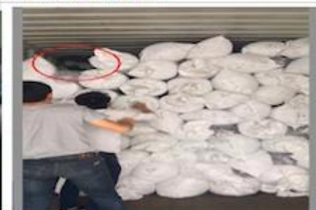
TRY BEST TO LOAD FULL