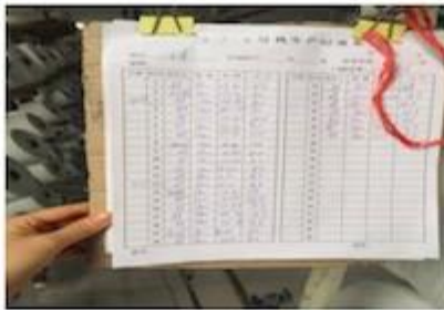
DETAILS NOTE DOWN