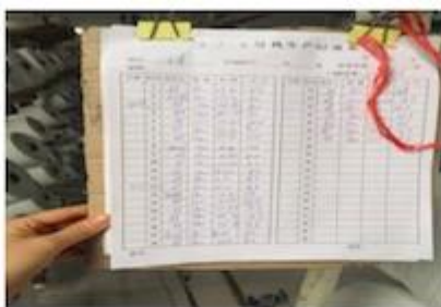
DETAILS NOTE DOWN