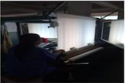
FABRIC FIRST TIME CHECKING