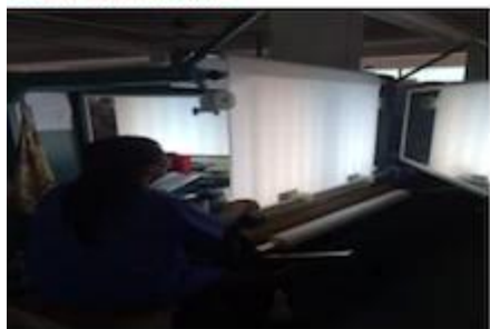
FABRIC FIRST TIME CHECKING