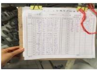
DETAILS NOTE DOWN