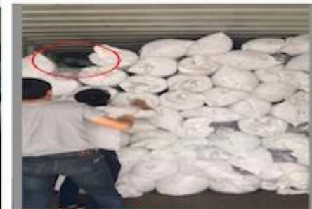
TRY BEST TO LOAD FULL