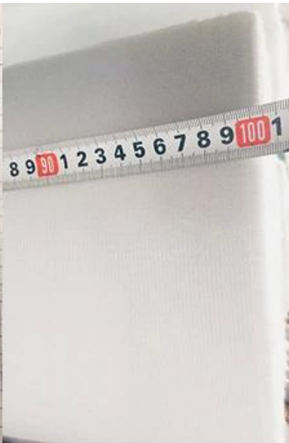
ضرعلا نم ققحتلا