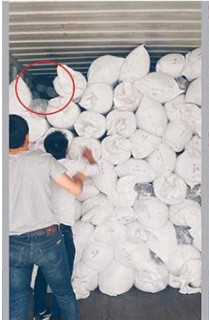
لمرك ليمحتل لصف أةلواجم