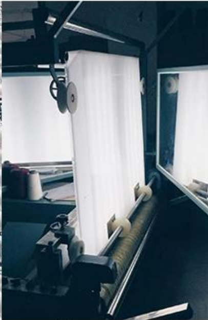
رايتخالالا جيسنالا ةدوج