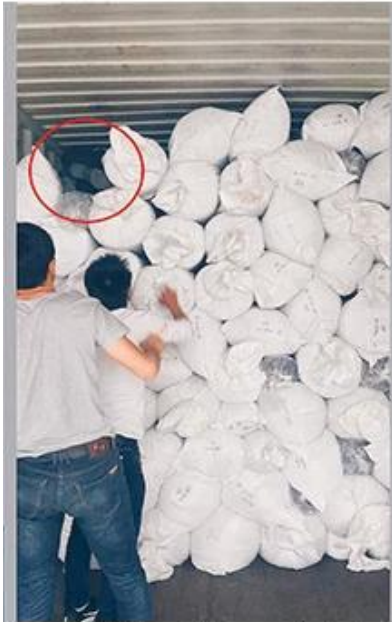
لمارك لي محتل لصف أة لواجم