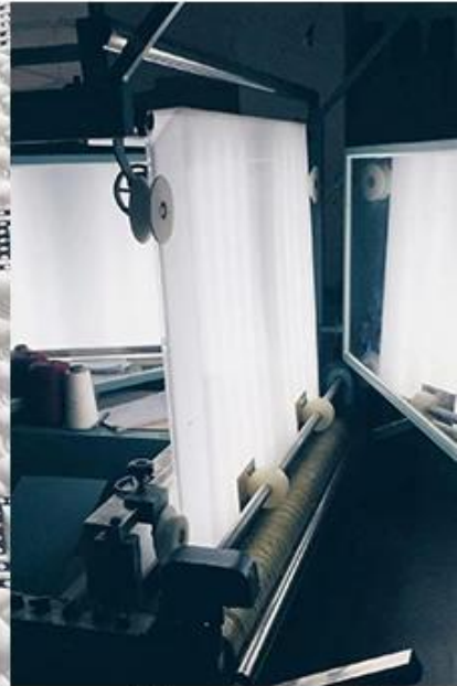
رايتخاللا جيسنلا ةدوج