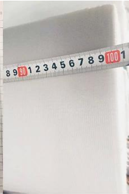
ضرعلا نم ققحتلا