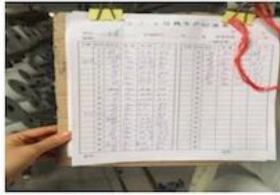
DETAILS NOTE DOWN