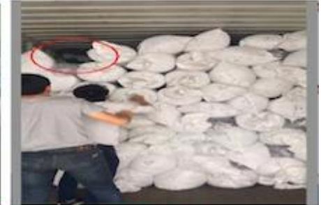
TRY BEST TO LOAD FULL