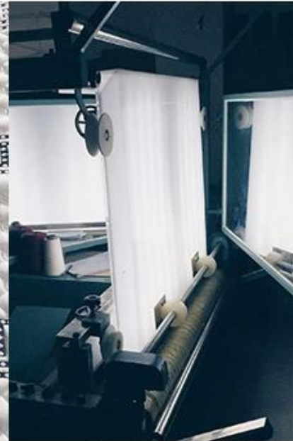
رايتخاللا چيسنلا ةدوج