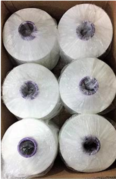
تبات لوزغلاو رتم بونتلا