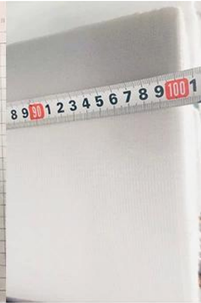
ضرعلا نمر ققحتلا