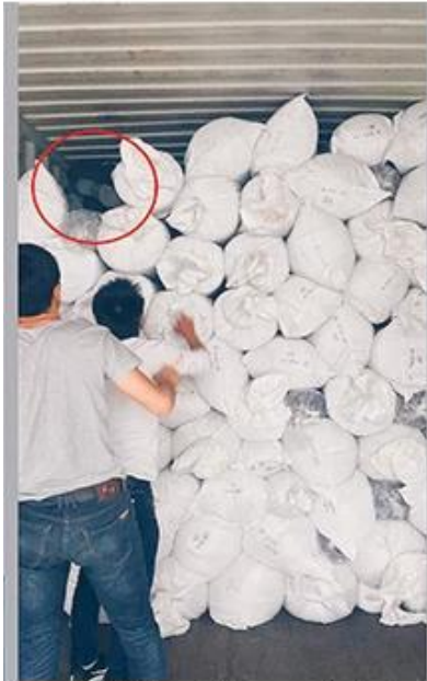
لمارك ليمحتل لضفأ ةلواجم