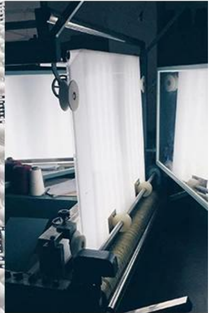
رايتخاللا جيسنالا ةدوج