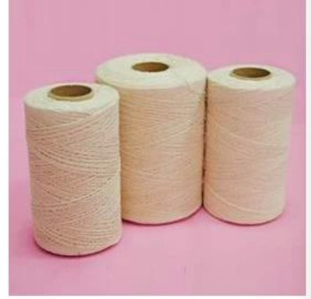
Flame Retardant Sewing Thread