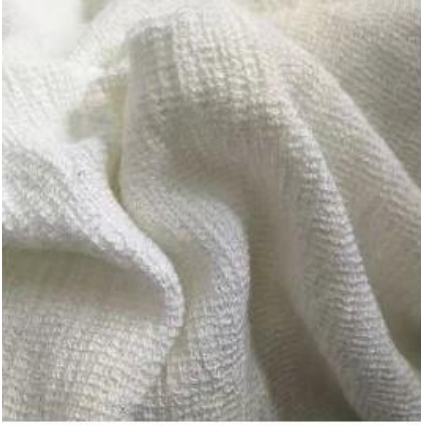
Flame Retardant Fabric