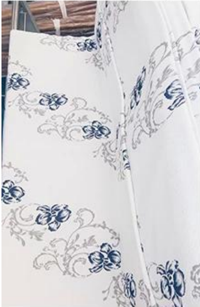
رايتخاللا ةيمك / مريمصت