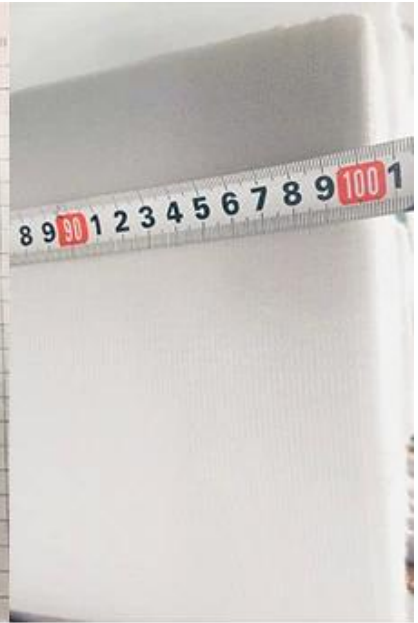
ضرعلا نم ققحتلا